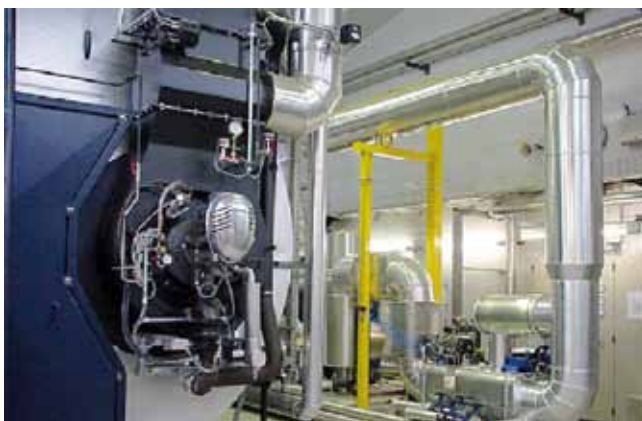
SAACKE burner SKV-SF at animal carcass "TBA Walsdorf"